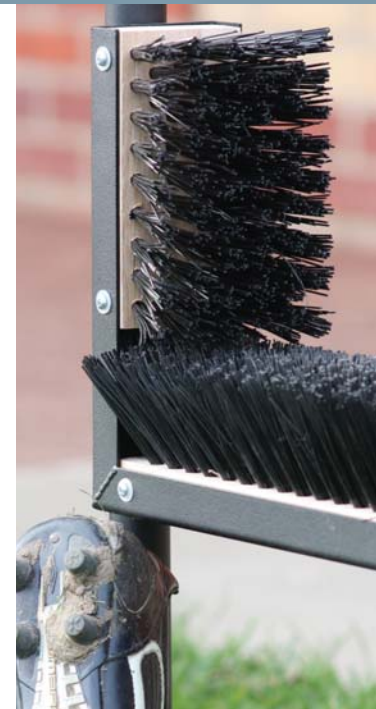
Boot Wiper Brush Detail