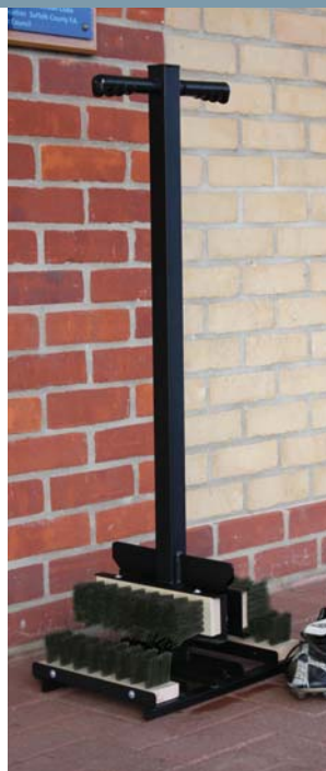
☒ Standard Boot Wiper

From the Standard single-person boot wiper, the heavy-duty Premier version to the Multi boot wiper for use by 1 - 4 persons, there is something to suit every requirement within our boot wiper range. Polyester powder coated matt black these sleek boot wipers are the perfect choice for all sports facilities.