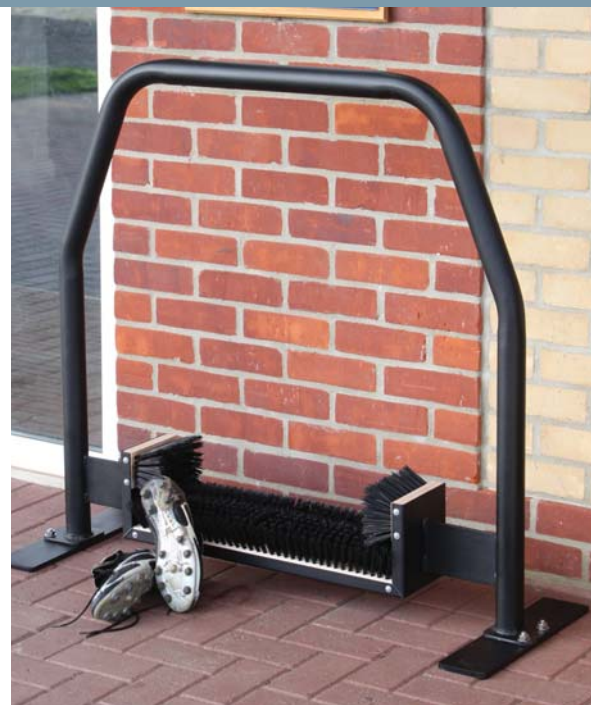
☒ Premier Freestanding Boot Wiper